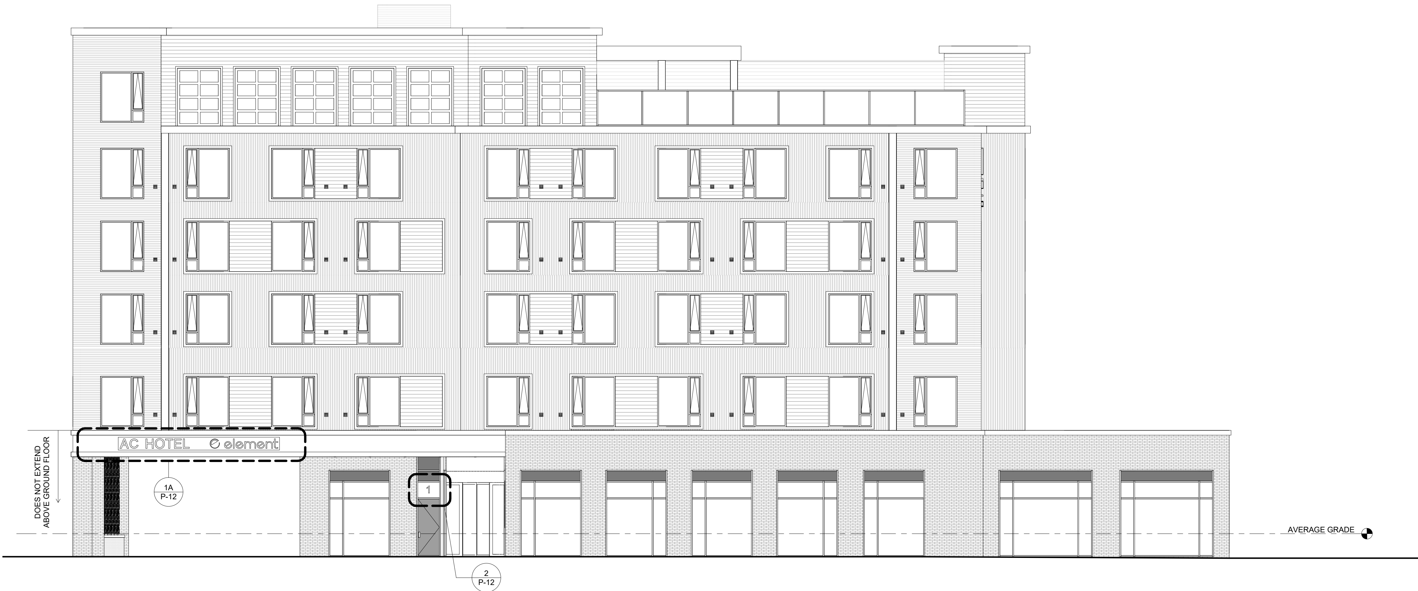
1 EXTERIOR SIGNAGE ELEVATION - SOUTH 1/8" = 1'-0"